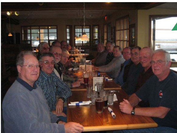
Men's lunch at the Salmon Point Pub November 7th

Oh I forgot to mention the November meeting is "election of officers for 2009 season"