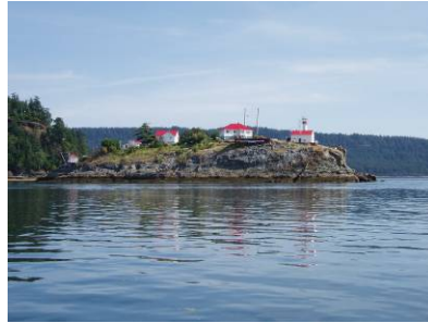
Chrome Island Light Station (1891)