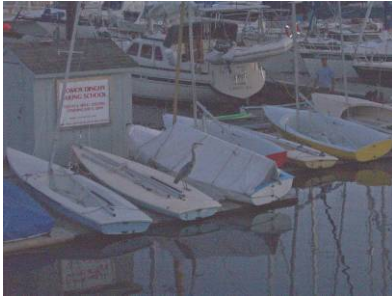
Comox Valley Sailing School – New recruit

July 2-09 Leave Discovery Harbour Marina at 1000 hrs on end of the flood tide; NW wind; Past Oyster River at 1200 hrs; Lost the wind at 1230 hrs; heavy swell, had to rig up pole and preventer stay on the boom; made about 2 n.mi. in 2 hrs; breeze picked up a bit at 1430 hrs; got wind back at 1600 hrs- making steady 4 knots (Bates Beach); huge yacht passed me, it slowed down but made a huge wake; nice breeze now, making 5 knots; passed over Comox Bar 1900 hrs, in to harbour 1930 hrs; big yacht tied up: "Reward"; when I registered, checked name: it's John Zigarlick's yacht; beautiful evening at Comox Harbour, new breed of sailing student (see photo)