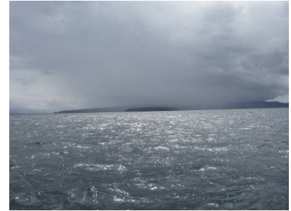
Squall on north end of Texada, looking Southeast.

July 3-09 Leave Comox Harbour 0800 hrs; close to low tide, beautiful day; slight breeze leaving Harbour then it died off and had to motor; arrived at Deep Bay 1100 hrs and rafted up to Dick Hahn's boat "Kyst" on a mooring buoy; unshipped dinghy and rowed in to dock; Came back at 2030 hrs after visit with Dick, peaceful night in Deep Bay.