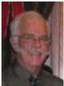
Commodores Sail Past May 10 th 2008