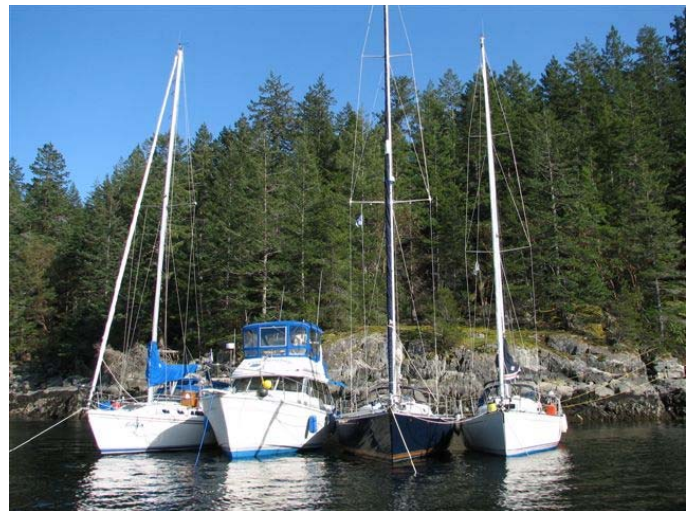
Here is a picture from the prawnathon days at the Twin Island anchorage. Britt...