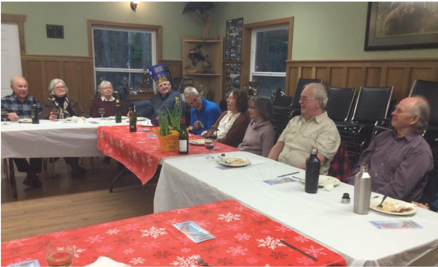
Convivial attendees, at the Pasta Night on March 16, 2022.

Please note that discounts are available for paid up members showing a current (2022) membership card at a number of local businesses. Our thanks go out to the following businesses in Campbell River that are currently participating in the discount program for Campbell River Yacht Club Members: