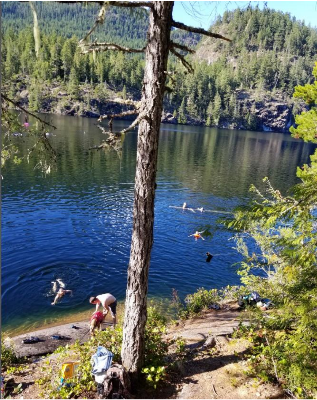
Cassel Lake on a beautiful summer's day.