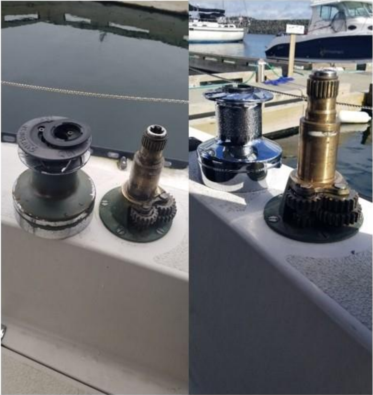
Winter Maintenance: What's old is new again!