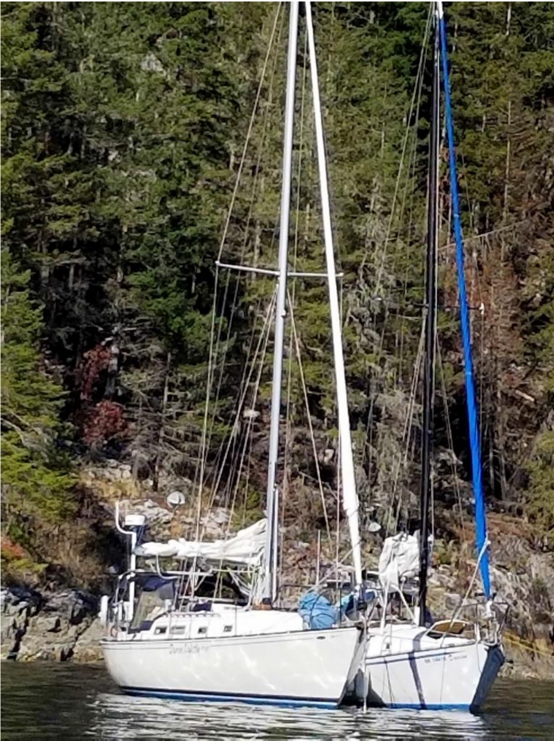
Stern-tied, SE end, Teakerne Arm.