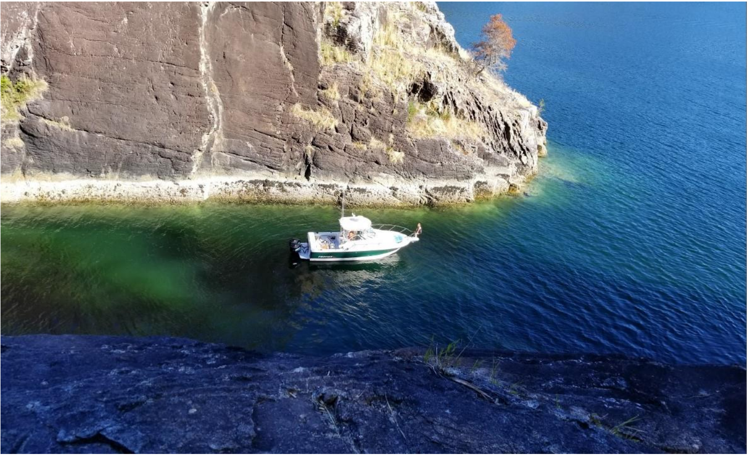
View of the narrow channel, from footpath to Cassel Lake.