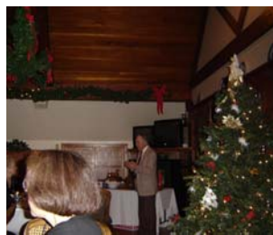
Small pictures of the Christmas party, any one like some?