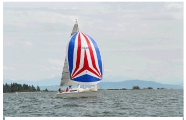
What and where is this?