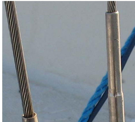
Wonder if it works on this?