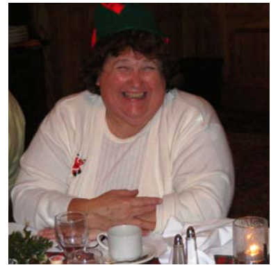
Table talk proved engaging and lively, with many laughs.