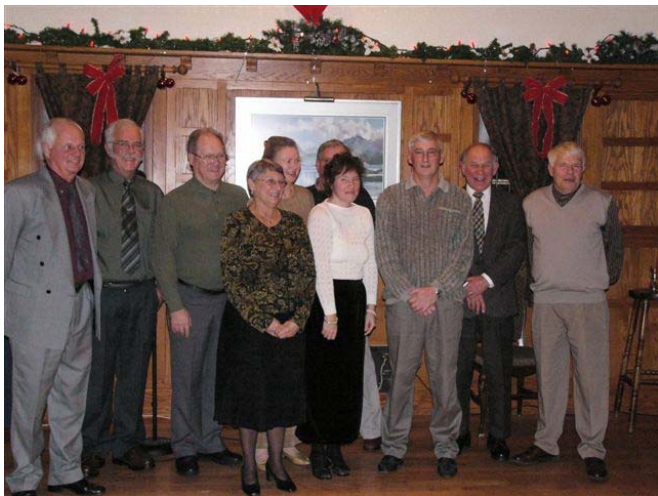
Our 2007 executive.