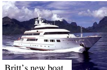
Britt's new boat

"THIS COMPUTER IS EQUIPPED WITH AN AIRBAG IN CASE YOU FALL ASLEEP!"